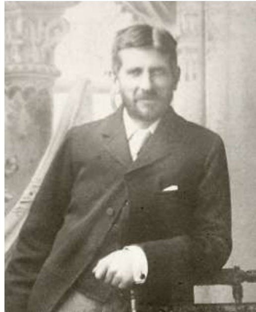
Edwin Walter TYLER gets a mention on the wall in Mill Street, behind The Castle pub - that building was his blacksmiths shop which ran along the back of The Castle pub.